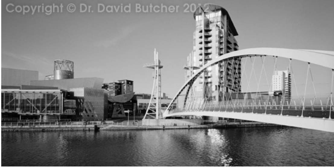
Salford Quays Lowry Bridge