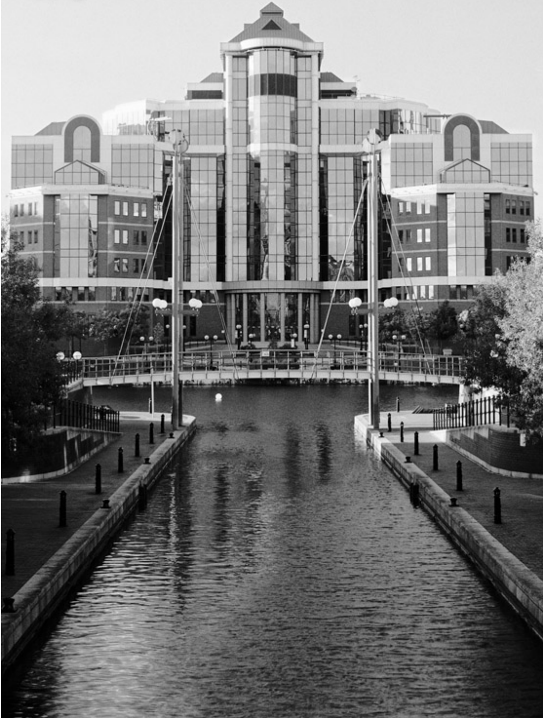
Manchester Castlefield, Canal and Railway Bridges