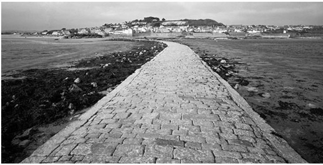
St Michael's Mount from causeway as tide comes in, Cornwall