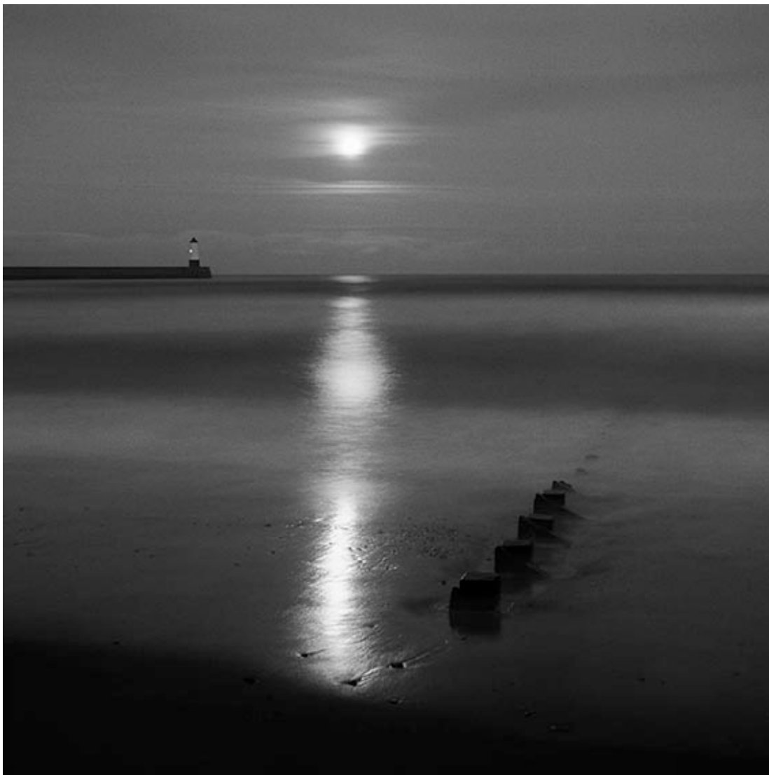
Berwick upon Tweed bridge reflections at night, England