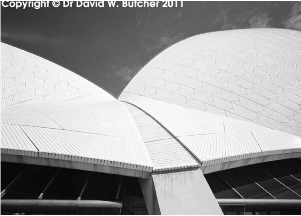
Sydney Harbour Bridge