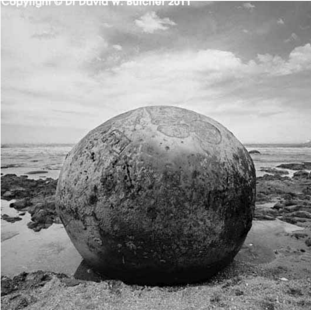
Moeraki Boulder broken open, South Island New Zealand