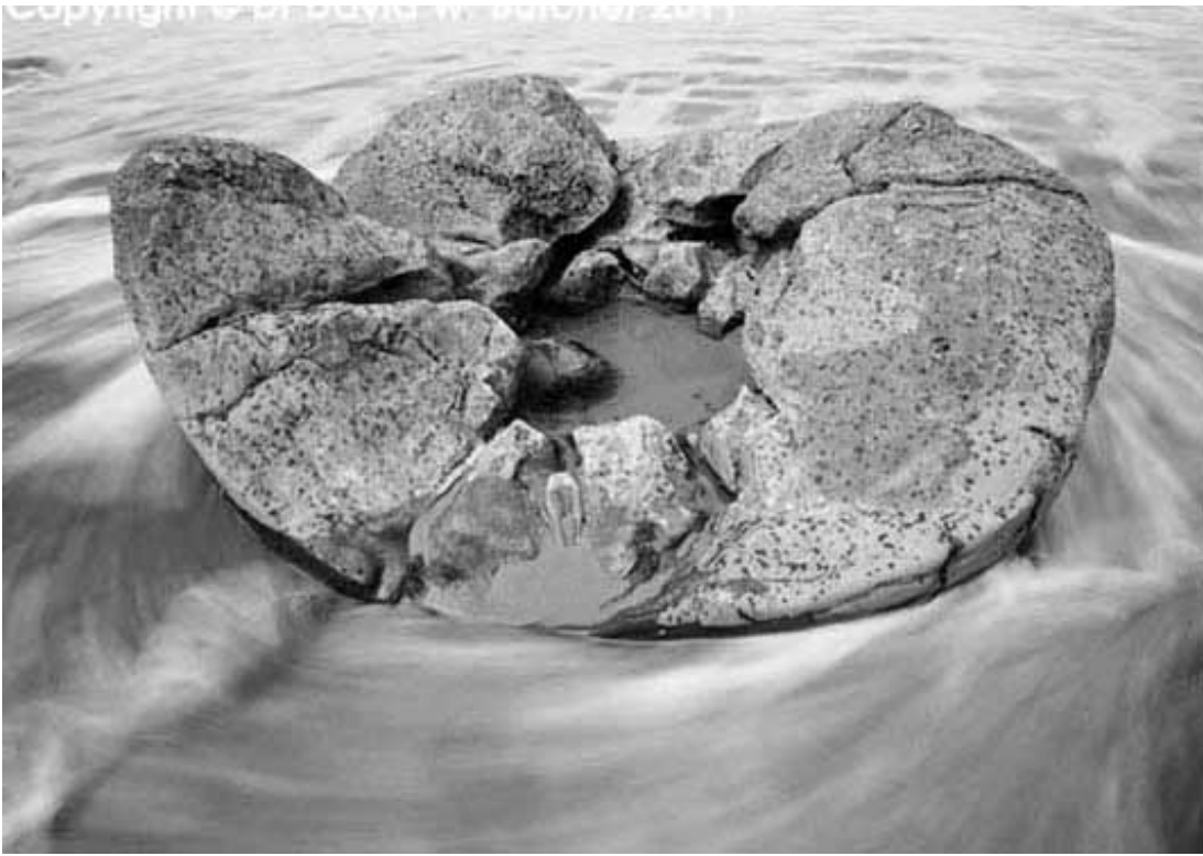
Mount Ngauruhoe and Mount Ruapehu from the summit of Mount Tongariro, North Island New Zealand. All 3 are volcanoes.