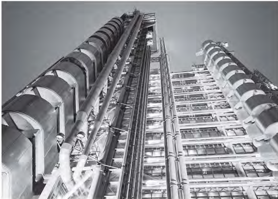
30. Lloyd's Building ©