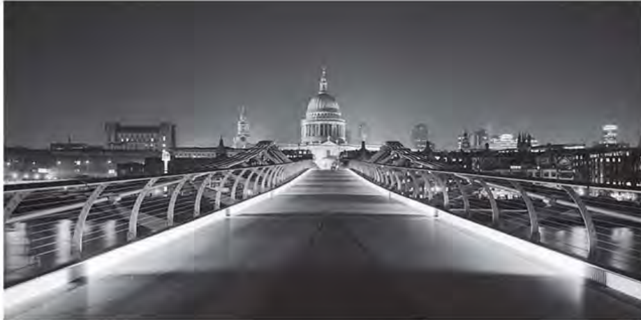
29. St Paul's from Millennium Bridge