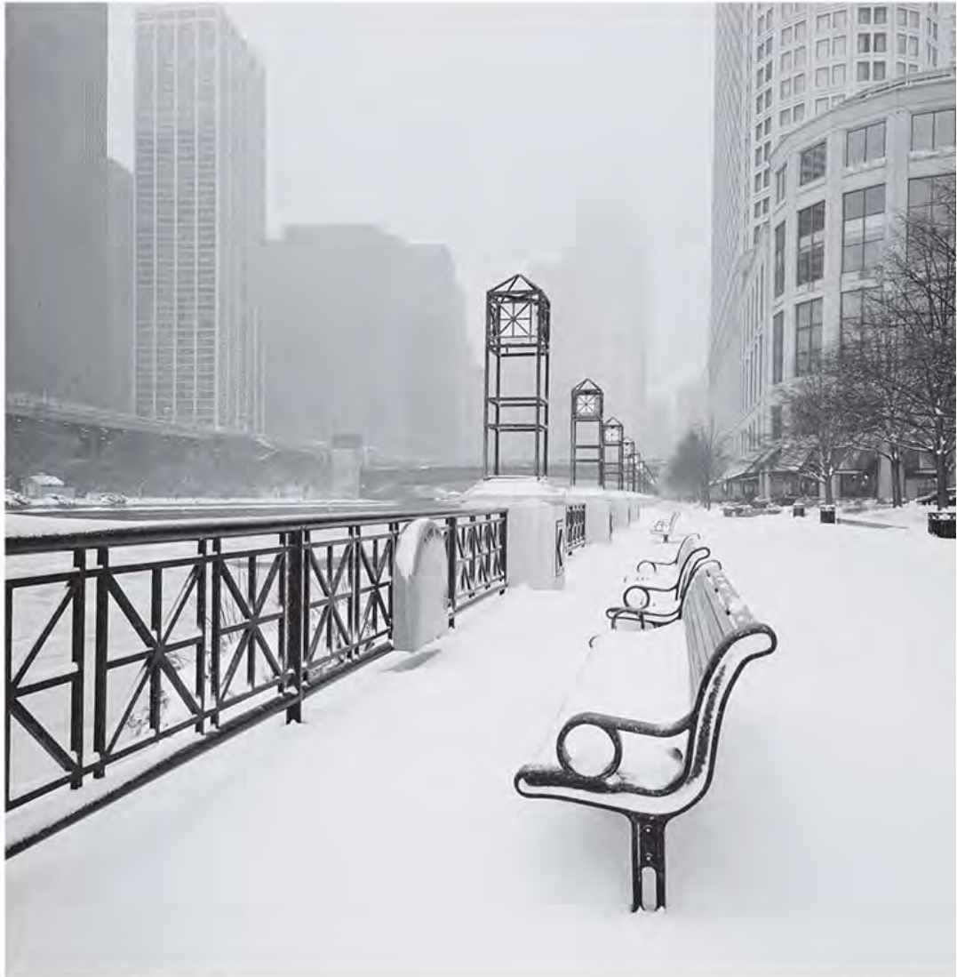
102. Chicago River Promenade in Snow