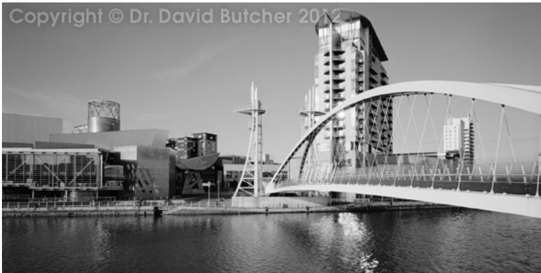
Salford Quays Lowry Bridge