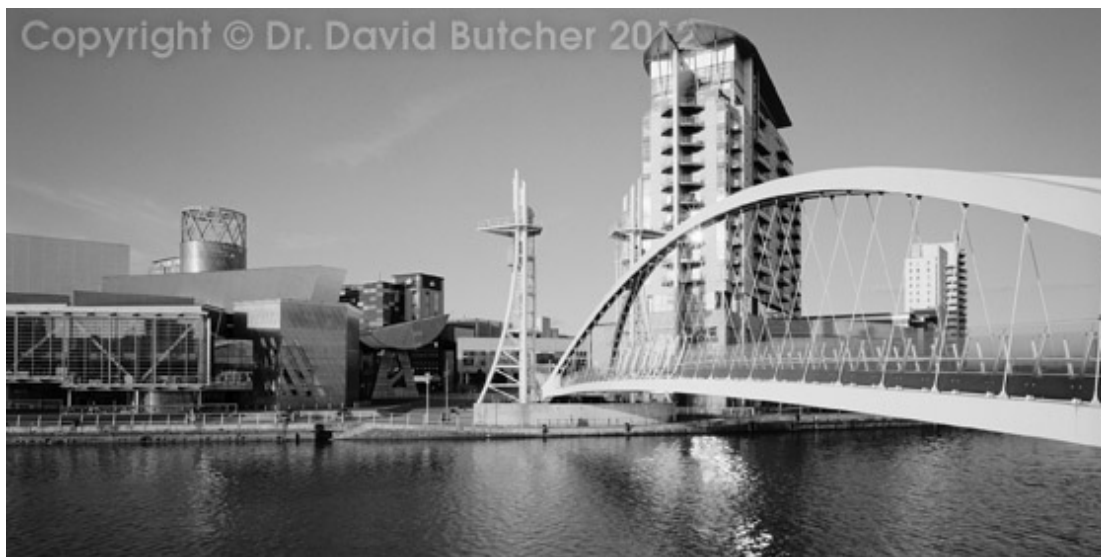
Salford Quays Victoria Building and Mariners Canal