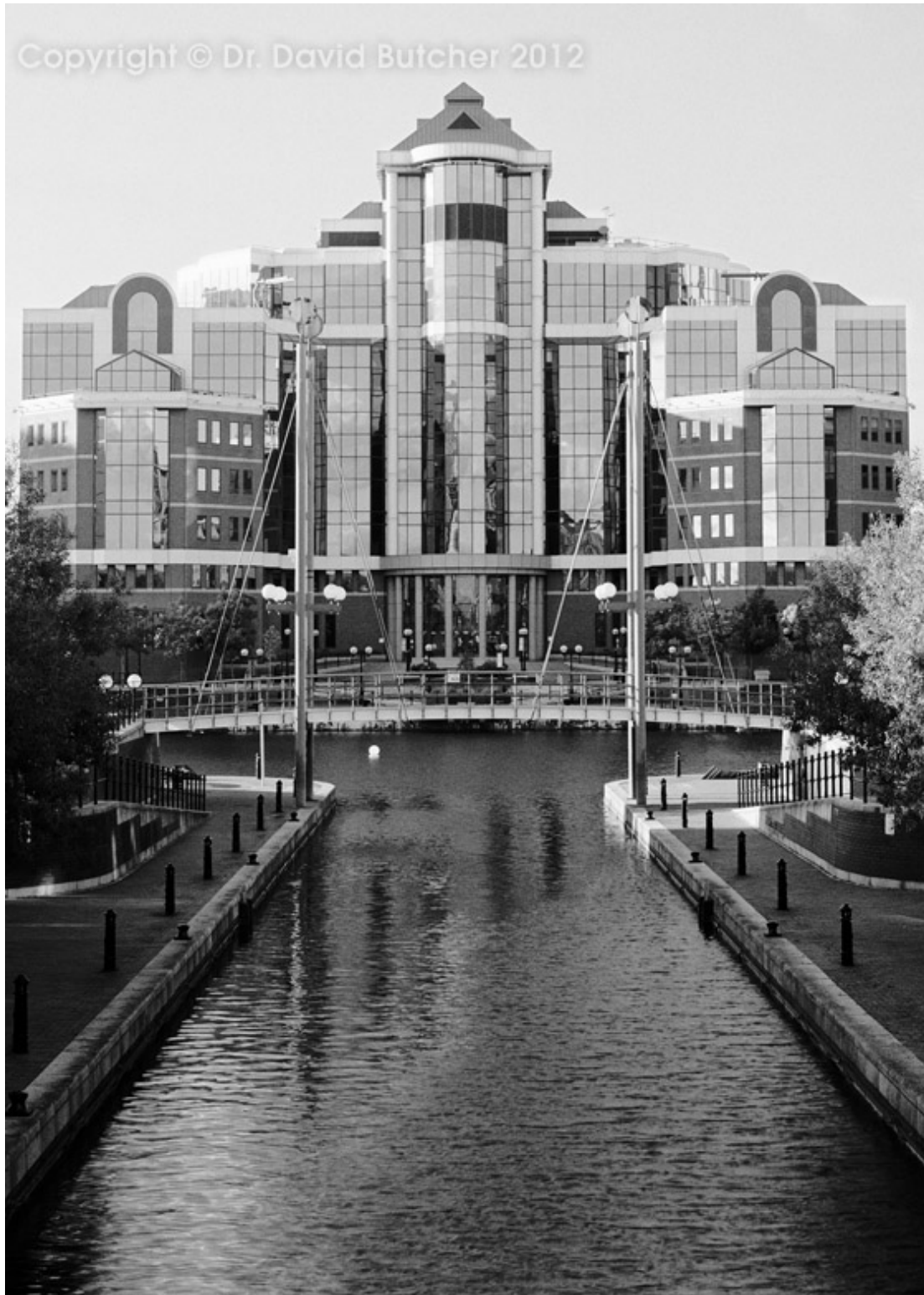
Manchester Castlefield, Canal and Railway Bridges