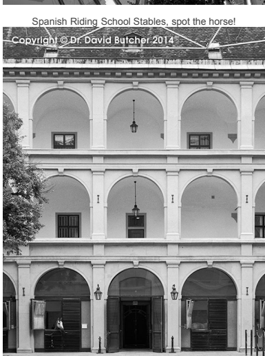
Prater Park Ferris Wheel at Dusk